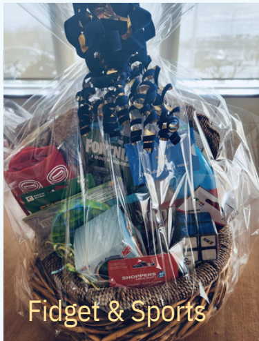
Fidget & Sports