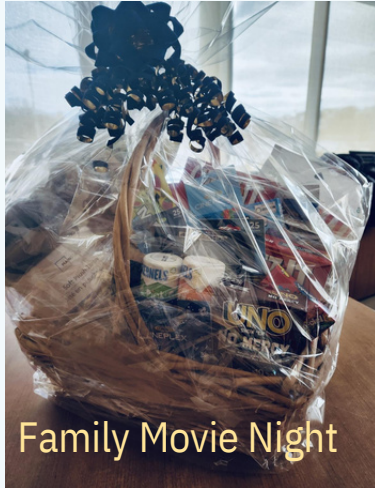
Family Movie Night